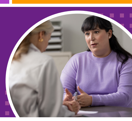
Not an actual patient or medical professional

Unexplained allergic reactions and recurring symptoms in your skin and gut could all be connected. If you suspect you have SM, use this guide to help you have an informative conversation with your doctor.